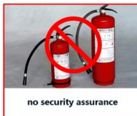
no security assurance