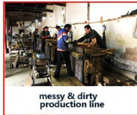
messy & dirty production line