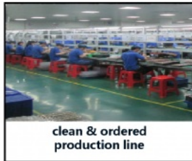
clean & ordered production line