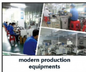
modern production equipments