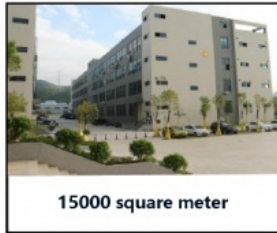
15000 square meter