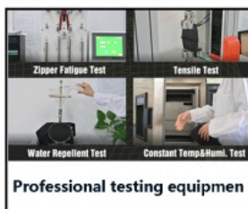
Professional testing equipmen