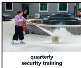
quarterly security training