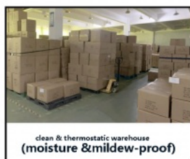
clean & thermostatic warehouse (moisture & mildew-proof)