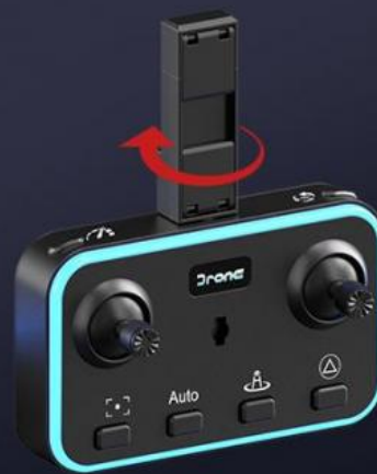
4.The mobile phone can be put on after the rotary support is fixed