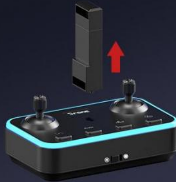
2.Take out the bracket