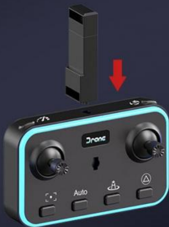
3.Place the bracket on the top of the remote control