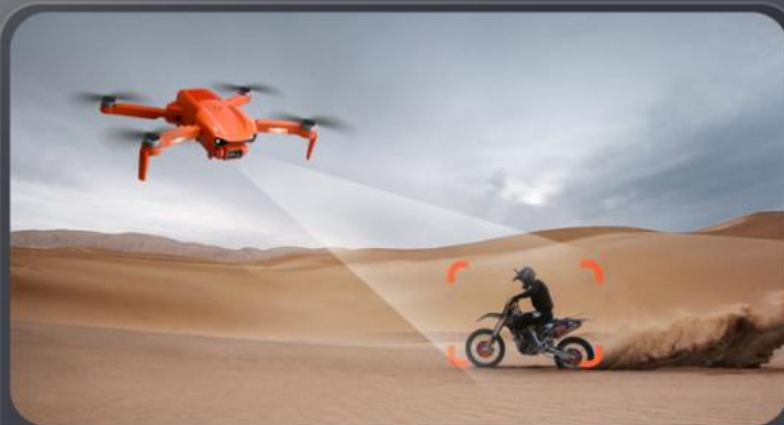
Smart Follow - No need to control, follow and shoot automatically.