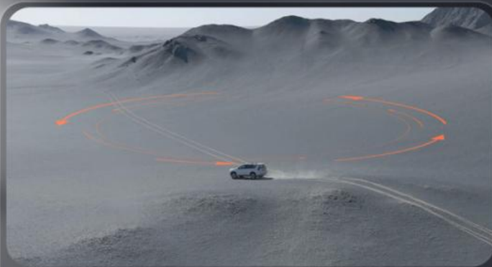
Surround Flight - 360° Surround Shooting Centered on the Remote Control.

Have a variety of fun flying games Feel the thrill of drones