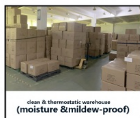
clean & thermostatic warehouse (moisture & mildew-proof)