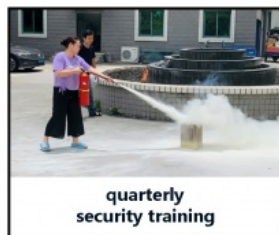
quarterly security training