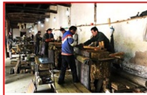
messy & dirty production line