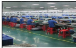
clean & ordered production line