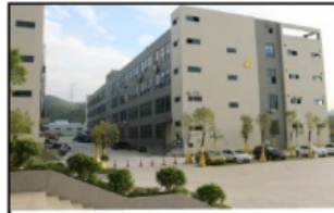
15000 square meter