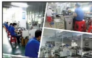
modern production equipments