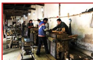
messy & dirty production line