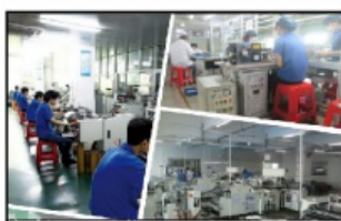
modern production equipments