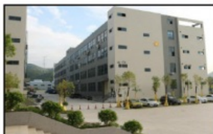
15000 square meter