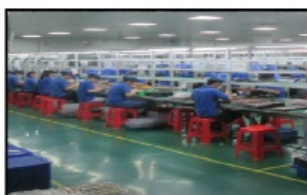
clean & ordered production line