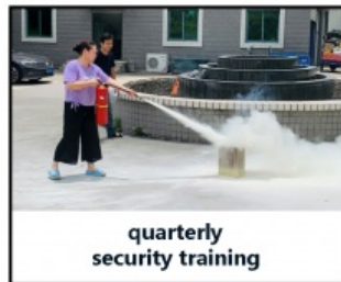
quarterly security training