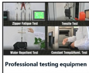
Professional testing equipmen