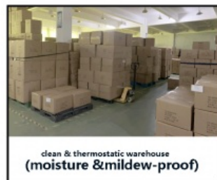
clean & thermostatic warehouse (moisture & mildew-proof)