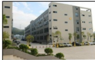
15000 square meter