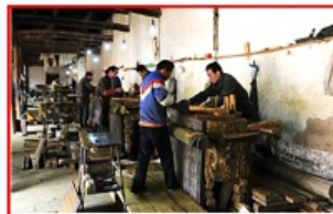
messy & dirty production line